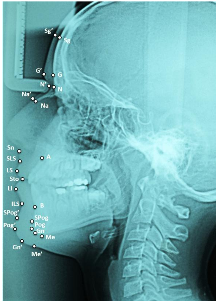
Fig. (1). Cranial landmarks according to George (20): supraglabella (Sg), glabella (G), nasion (N), nasale (Na), Point A (A), Point B (B), suprapogonion (SPog), pogonion (Pog), gnathion (Gn), menton (Me). Facial landmarks: supraglabella (Sg'), glabella (G'), nasion (N'), nasale (Na'), subnasale (Sn), superior labial sulcus (SLS), labrale superius (LS), stomion (Sto), labrale inferius (LI), inferior labial sulcus (ILS), suprapogonion (SPog'), pogonion (Pog'), gnathion (Gn'), menton (Me').